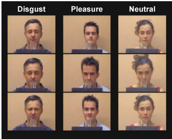
Figure 1. Frames from Movies Used in the Visual Runs

The demonstrators leaned forward to sniff at the content of a glass (top two rows) and then retracted the torso and expressed a facial expression of disgust (left) pleasure (center) or neutral (right column). Each movie lasted 3 s. Six different demonstrators (three are shown here) expressed the three types of facial expressions, leading to six variants of each expression. A vision-of-disgust block, for instance, was then composed of the six variants of the disgusted emotion separated by 1 s pauses.